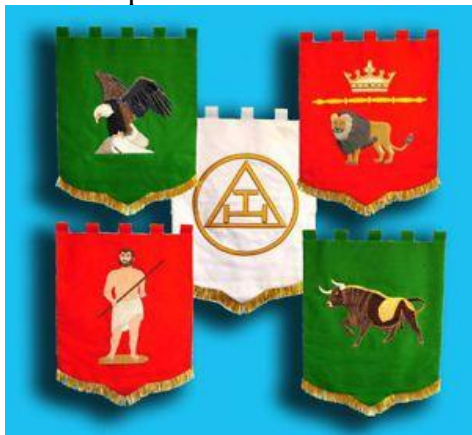
Red Cross of Babylon

Pavement Tracing Board Principals Robes Principals Crowns/Mitre Principals sceptres x 3 Sojourners batons x3 Large Standard – Ox, Lion, Man, Eagle, Royal Arch Tribal Banner – set of 12 Banner Poles for 12 Tribes Sojourner and Scribe Surplice x 5 (Scribes red cowl) Officers Collar x 12 Officers Collar Jewel x 12 Set of Seven Letters for the altar Ditto Hebrew characters scroll for use at Exaltation ceremonies Principals Sceptres and stands Satin Veil for the double cube Altar (Double cube) Candles and stands (3 large 3 small) Royal Arch Tools Crowbar, Pick & Shovel Royal Arch jewel for vault Square & Compasses 6-pointed star