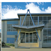
LEFT TO RIGHT: LODGE ARROW KILWINNING, ARROWTOWN; THE WAITOHI LODGE, PICTON; SOUTHLAND FREEMASONS CENTRE, INVERCARGILL; NORTH SHORE MASONIC CENTRE, AUCKLAND