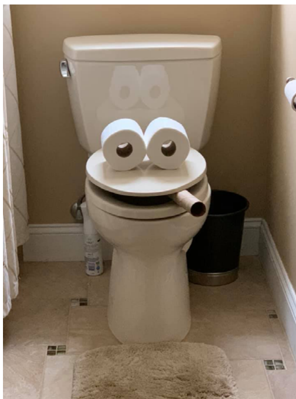
A Bored Potential Artist?