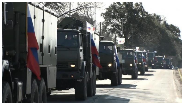
RUSSIAN AID CONVOY ON WAY TO BERGAMO – KAMAZ TRUCKS