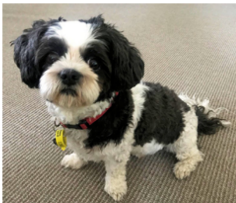
RW. Dog "Harry" Salmon.

B.T.W. The RW before "Dog" stands for "Really Wonderful"