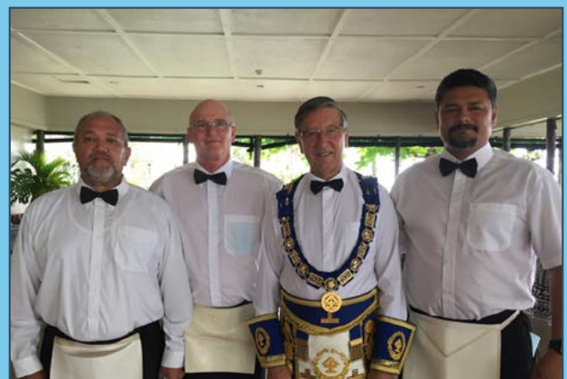
Northern Division Grand Master with three Entered Apprentices in Samoa