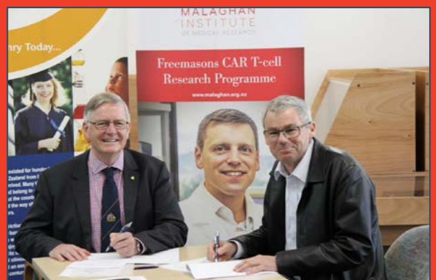
The Freemasons CAR T-cell Research Programme