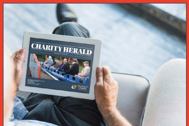
The Charity Herald