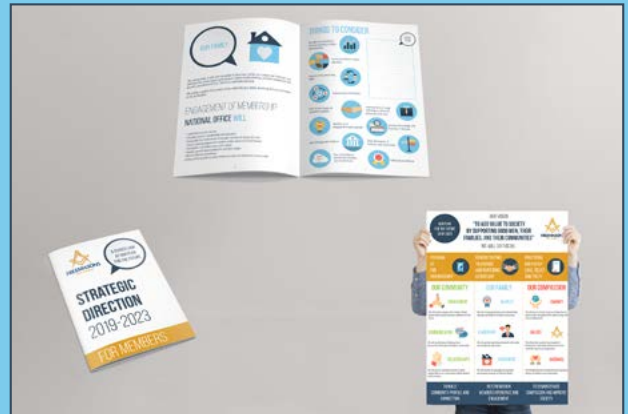
The three documents of our five-year Strategic Direction